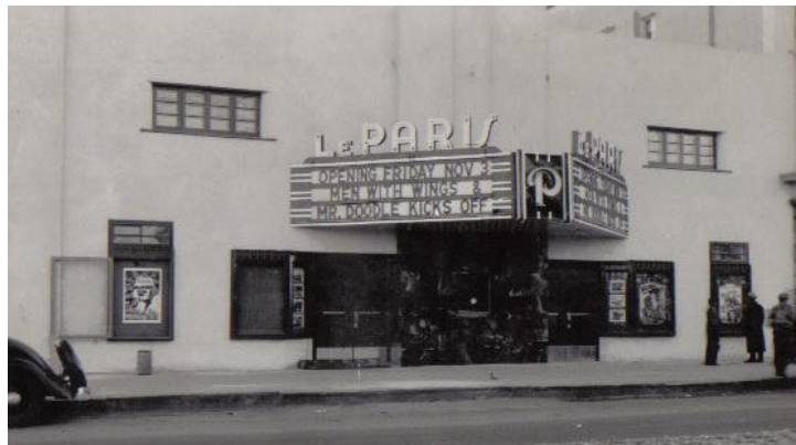
Le Paris, St. Boniface's first movie theatre, 1939, Provencher Boulevard.